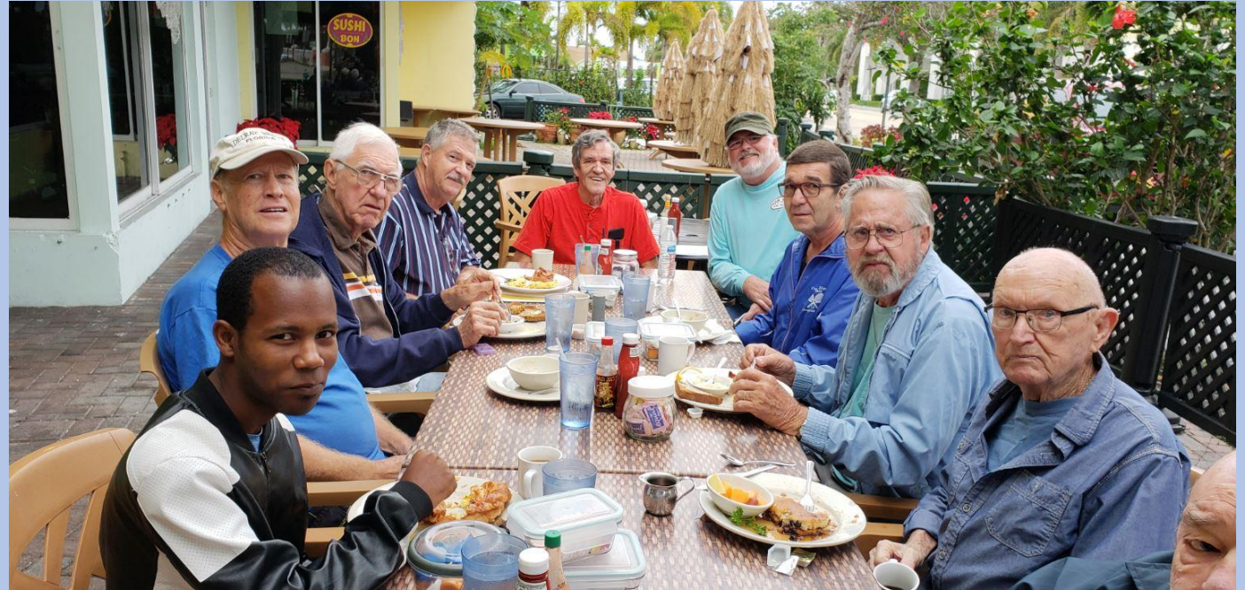
It was chilly and windy, and the food was great. This was our first breakfast meeting of 2019 We meet the first Saturday of the month usually in our Fellowship Hall at 8 am.